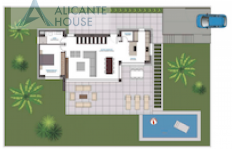
VIVIENDAS 5-7 | HOUSES 5-